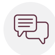
Maintain and Support