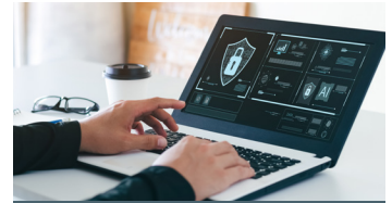
Limited Access to Information