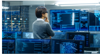
Too Many Systems