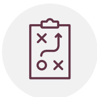
Plan and Prepare

Langan's Digital EHS Management and Compliance team helps our clients from project inception through rollout, and also can provide ongoing maintenance and support.