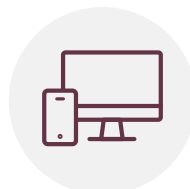
Finalize and Rollout