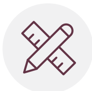
Design and Blueprint