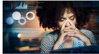
Inefficient Data Collection and Reporting