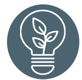
Community Choice Aggregation (CCA)