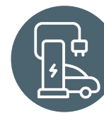
Electric Vehicle (EV) Charging