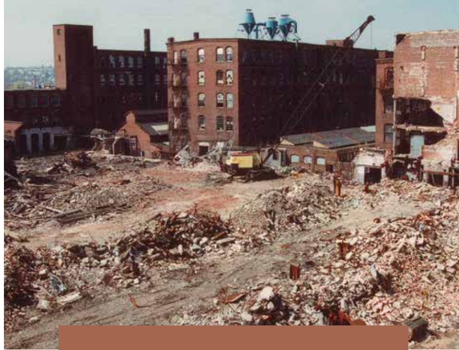
Scovill Brass Factory Waterbury, CT