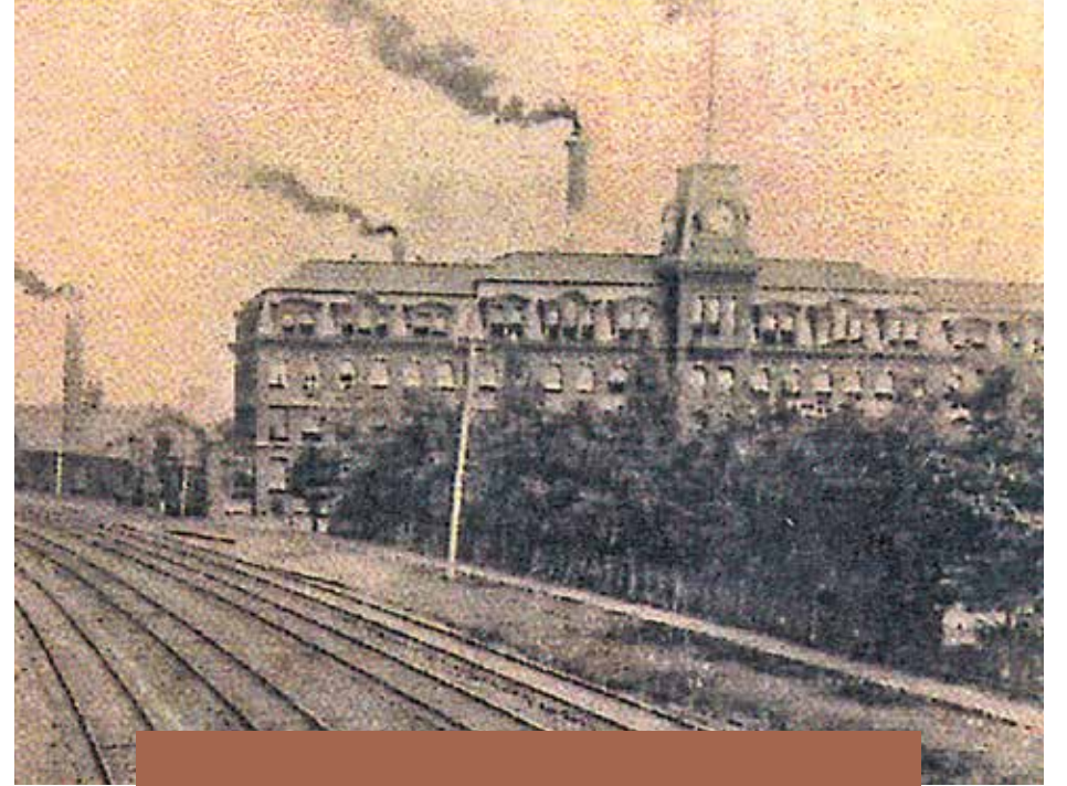
Singer Industrial Center Elizabeth, NJ