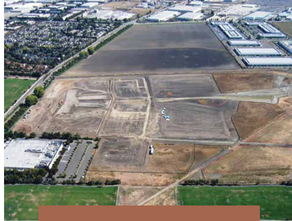
Ohlone Community College Newark, CA