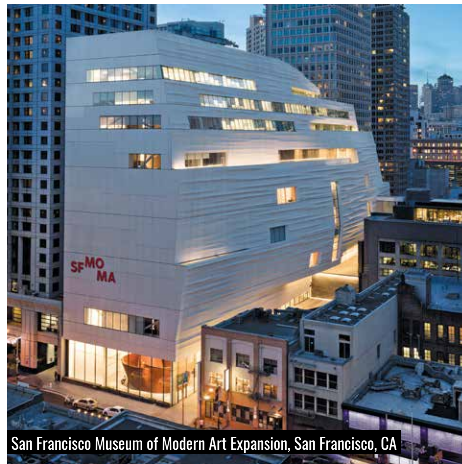
San Francisco Museum of Modern Art Expansion, San Francisco, CA