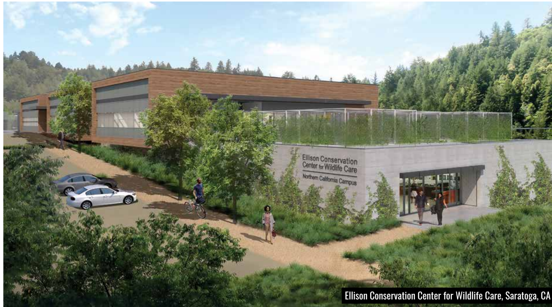
Ellison Conservation Center for Wildlife Care, Saratoga, CA