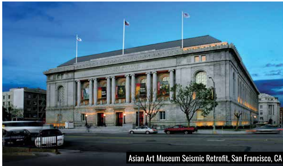
Asian Art Museum Seismic Retrofit, San Francisco, CA