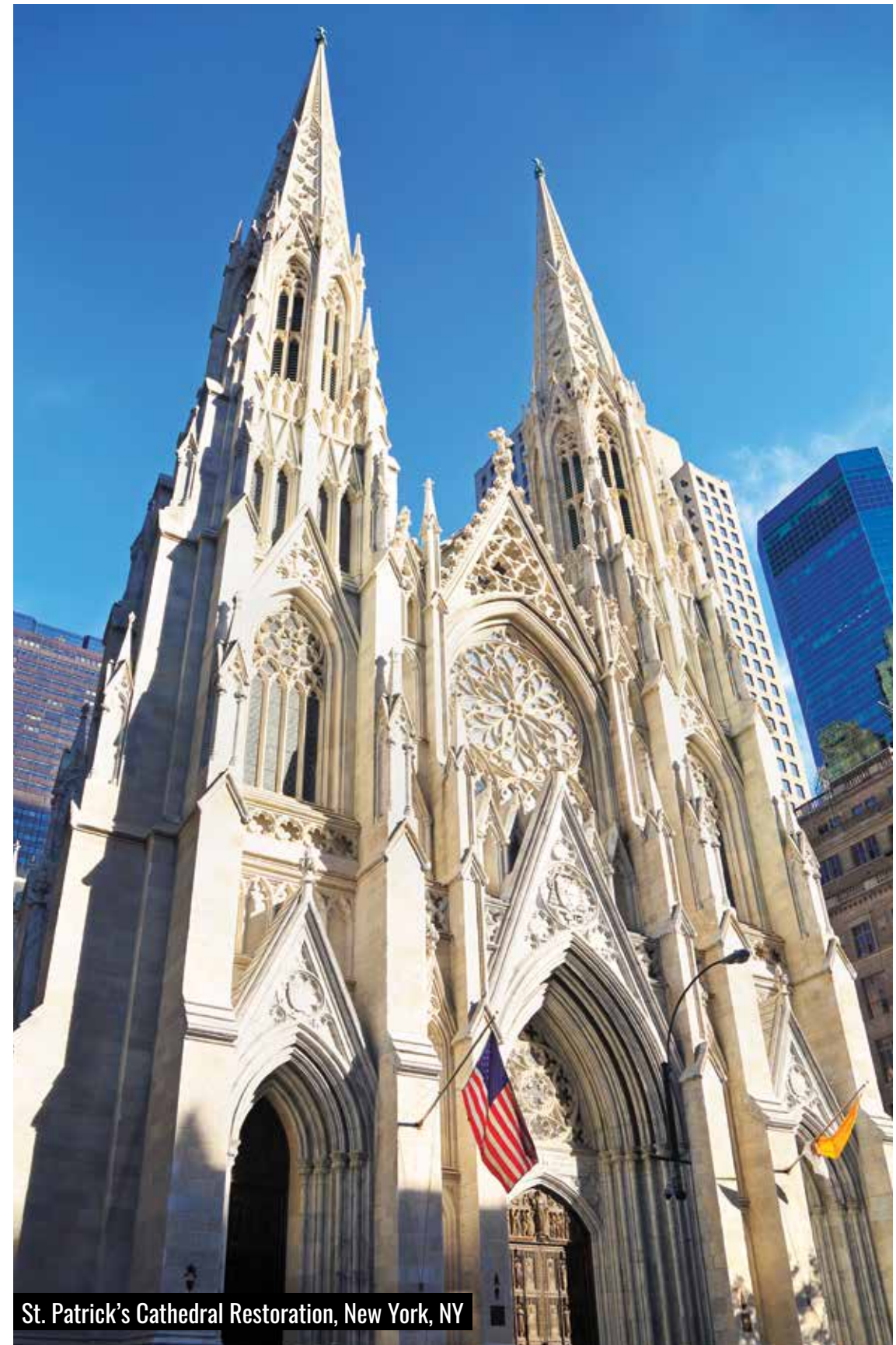
St. Patrick's Cathedral Restoration, New York, NY