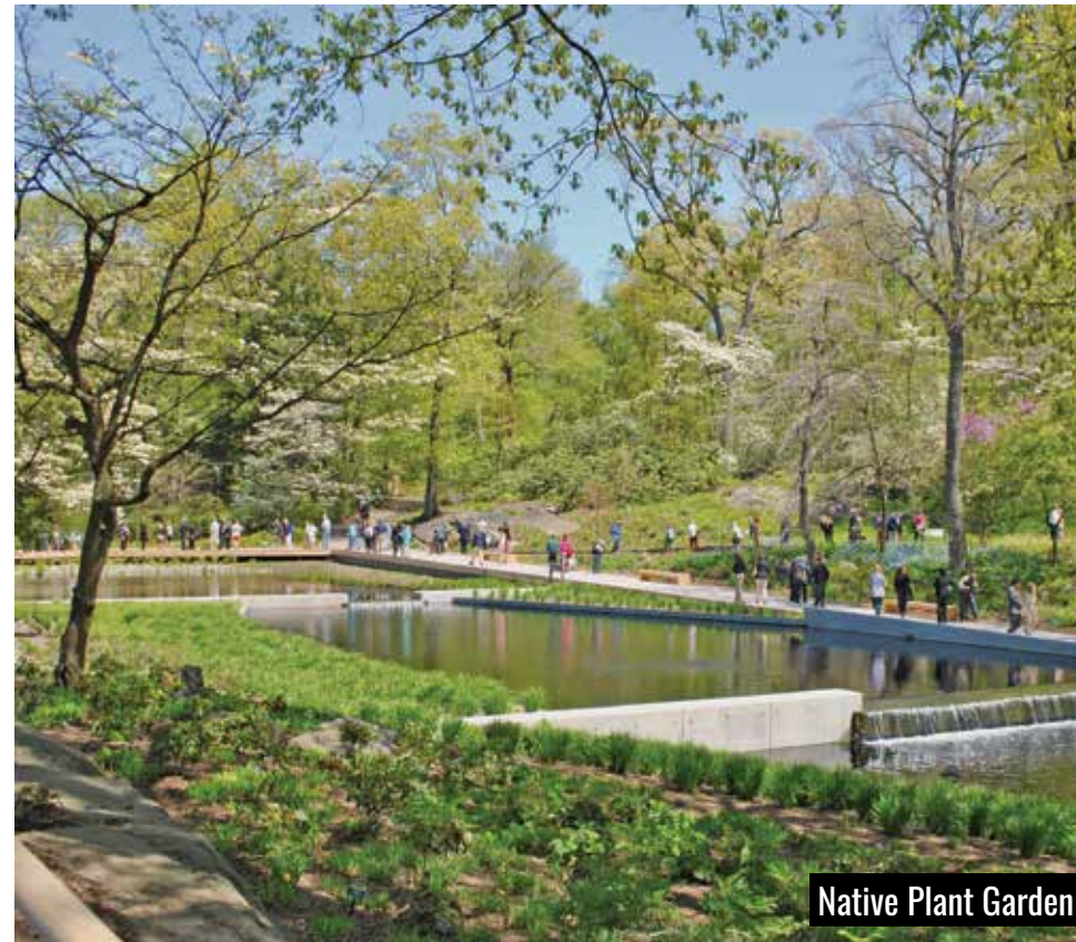
Native Plant Garden

Langan provided fully integrated services on several major projects for the New York Botanical Garden including the Visitor's Center, Nolan Greenhouses, Horticultural Services Facility, Edible Academy, Native Plant Garden, and parking structures.