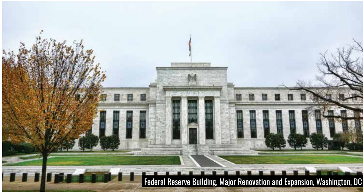
Federal Reserve Building, Major Renovation and Expansion, Washington, DC