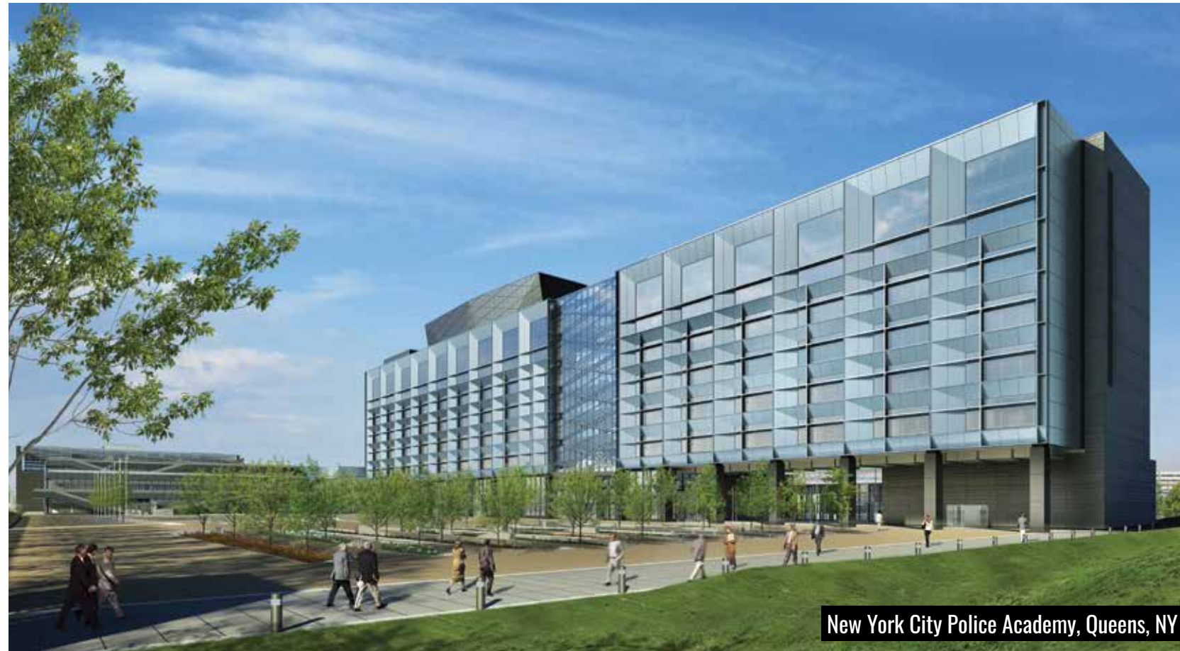
New York City Police Academy, Queens, NY