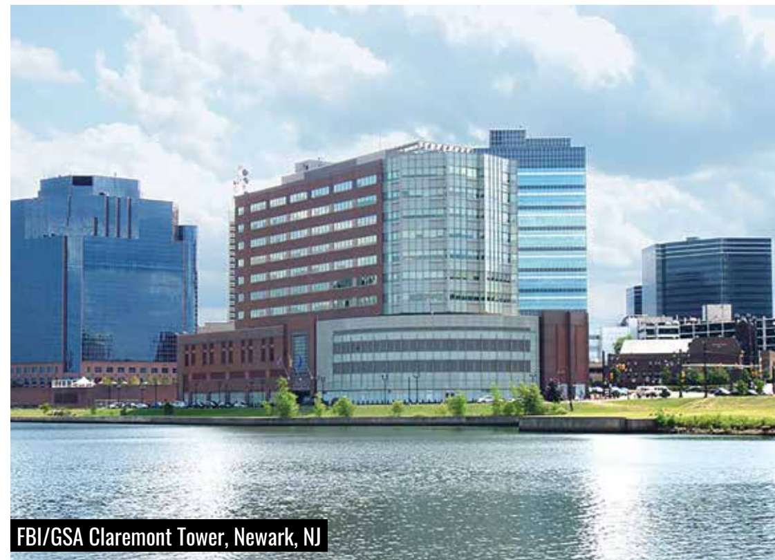
FBI/GSA Claremont Tower, Newark, NJ