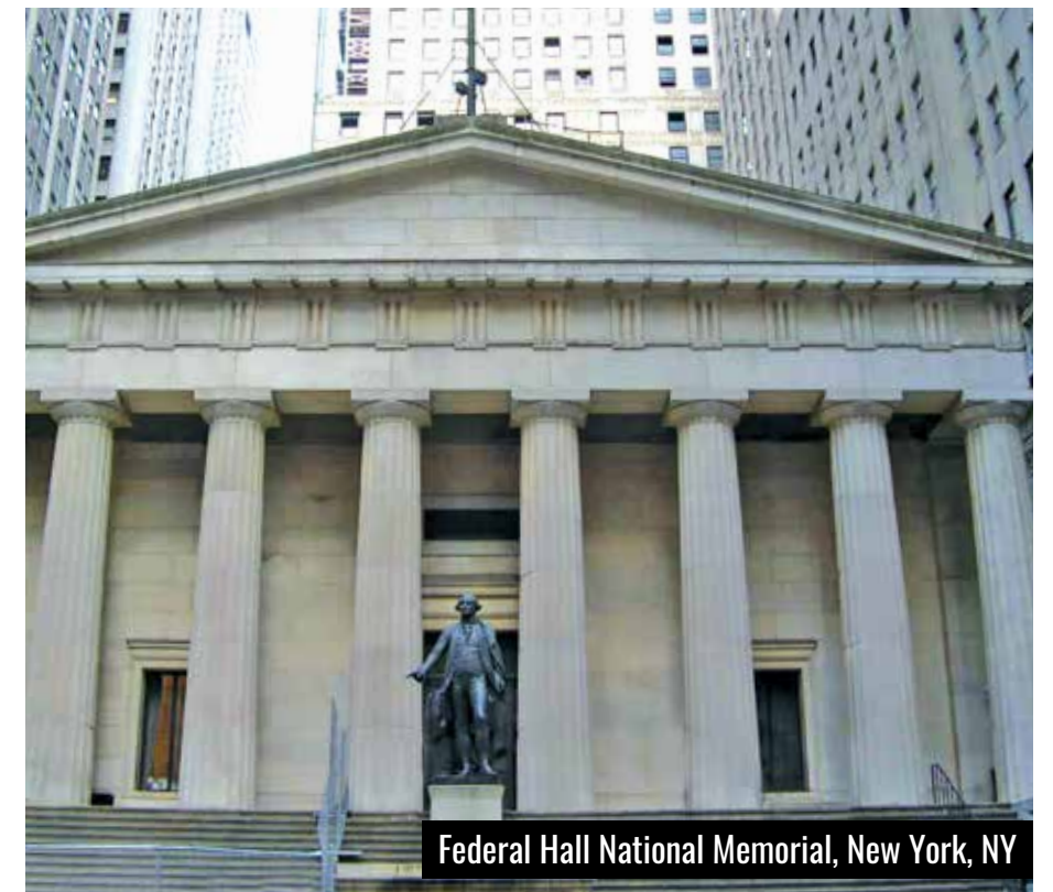
Federal Hall National Memorial, New York, NY