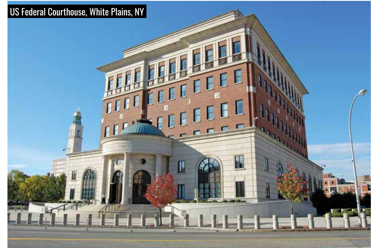
US Federal Courthouse, White Plains, NY