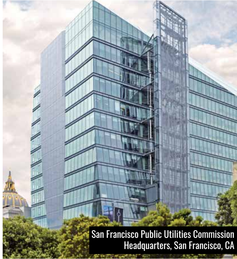
San Francisco Public Utilities Commission Headquarters, San Francisco, CA