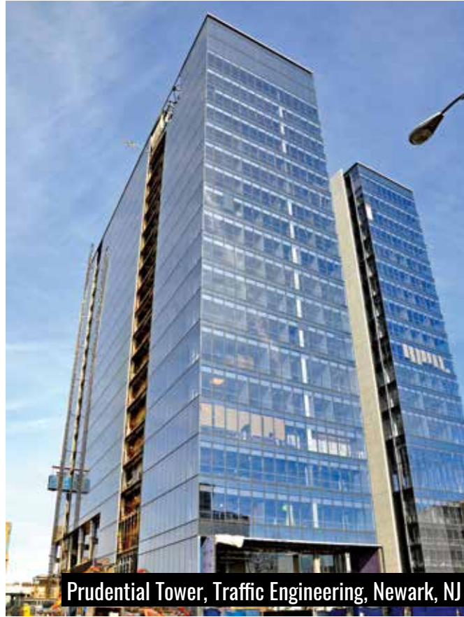
Prudential Tower, Traffic Engineering, Newark, NJ