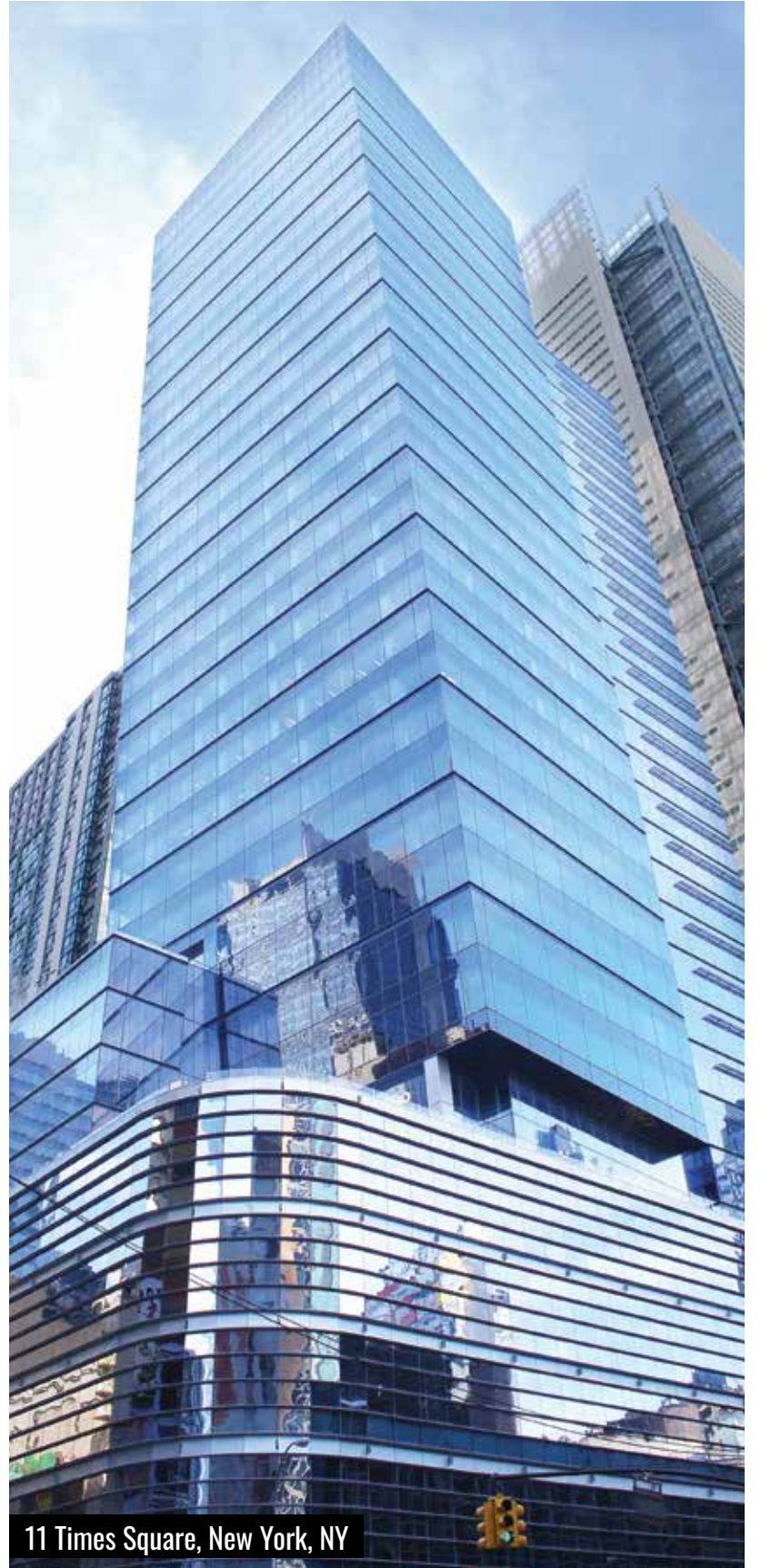
11 Times Square, New York, NY