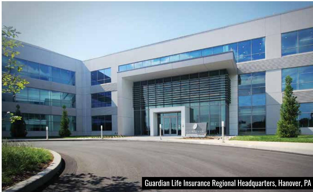
Guardian Life Insurance Regional Headquarters, Hanover, PA