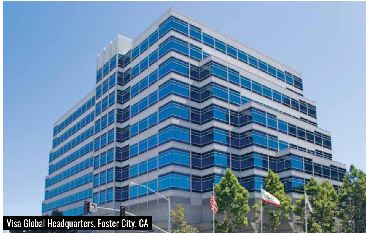
Visa Global Headquarters, Foster City, CA