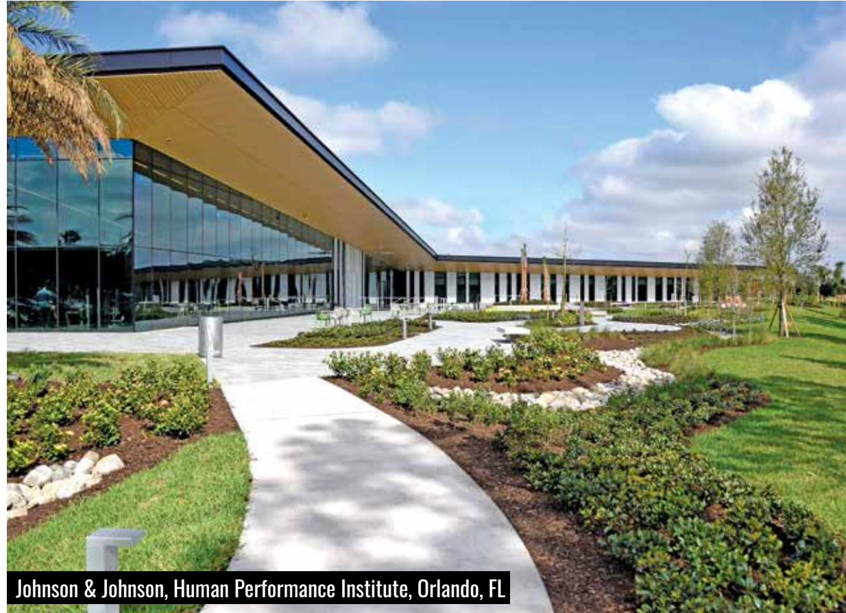
Johnson & Johnson, Human Performance Institute, Orlando, FL