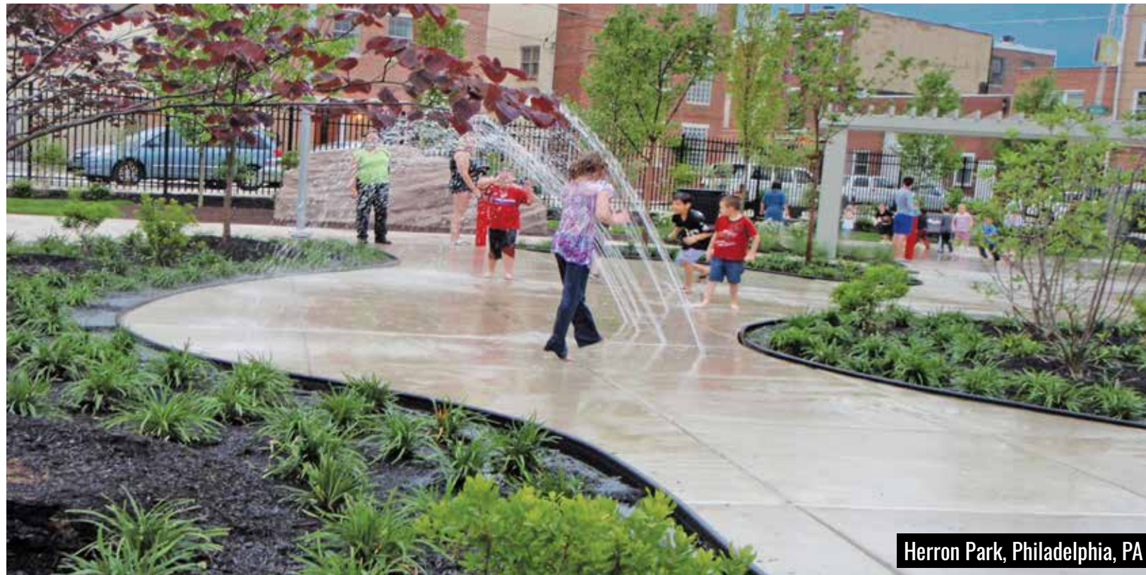
Herron Park, Philadelphia, PA