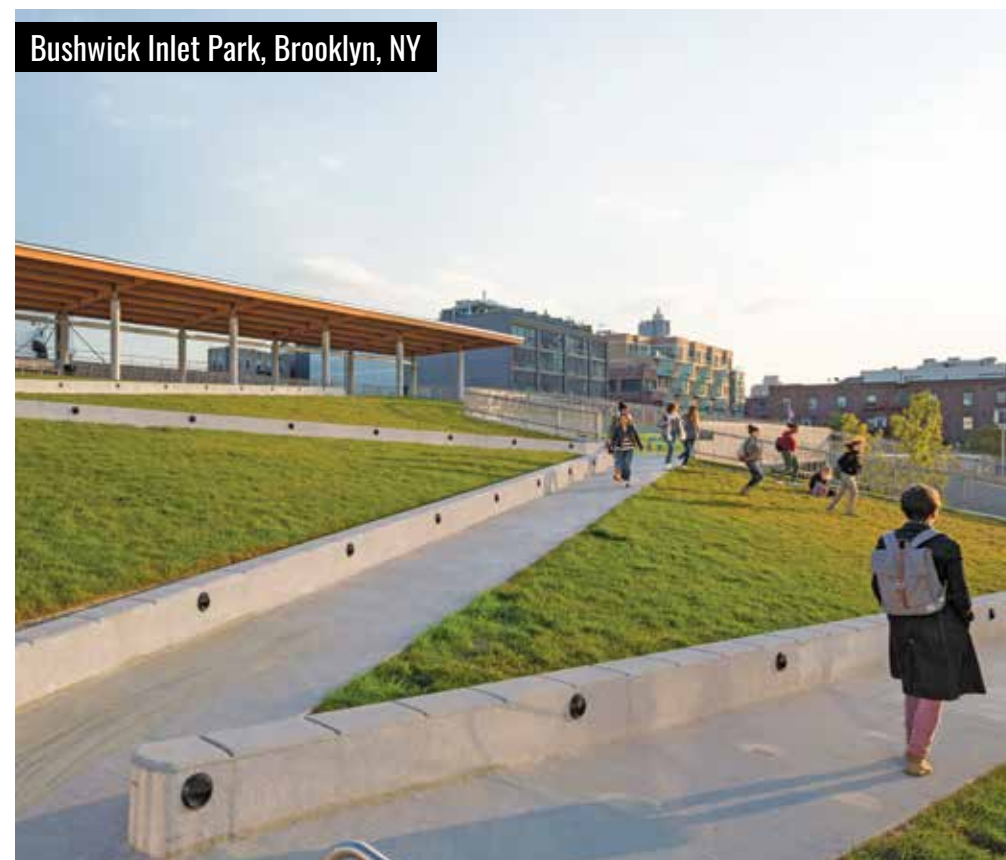
Bushwick Inlet Park, Brooklyn, NY