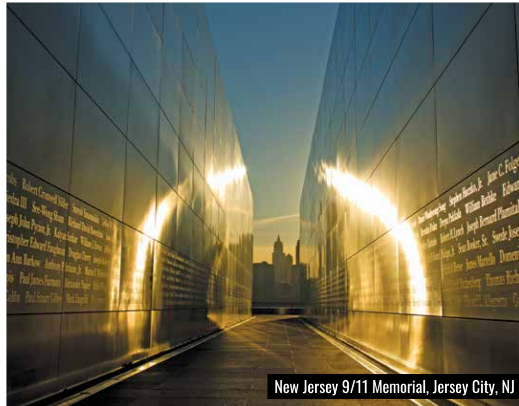
New Jersey 9/11 Memorial, Jersey City, NJ