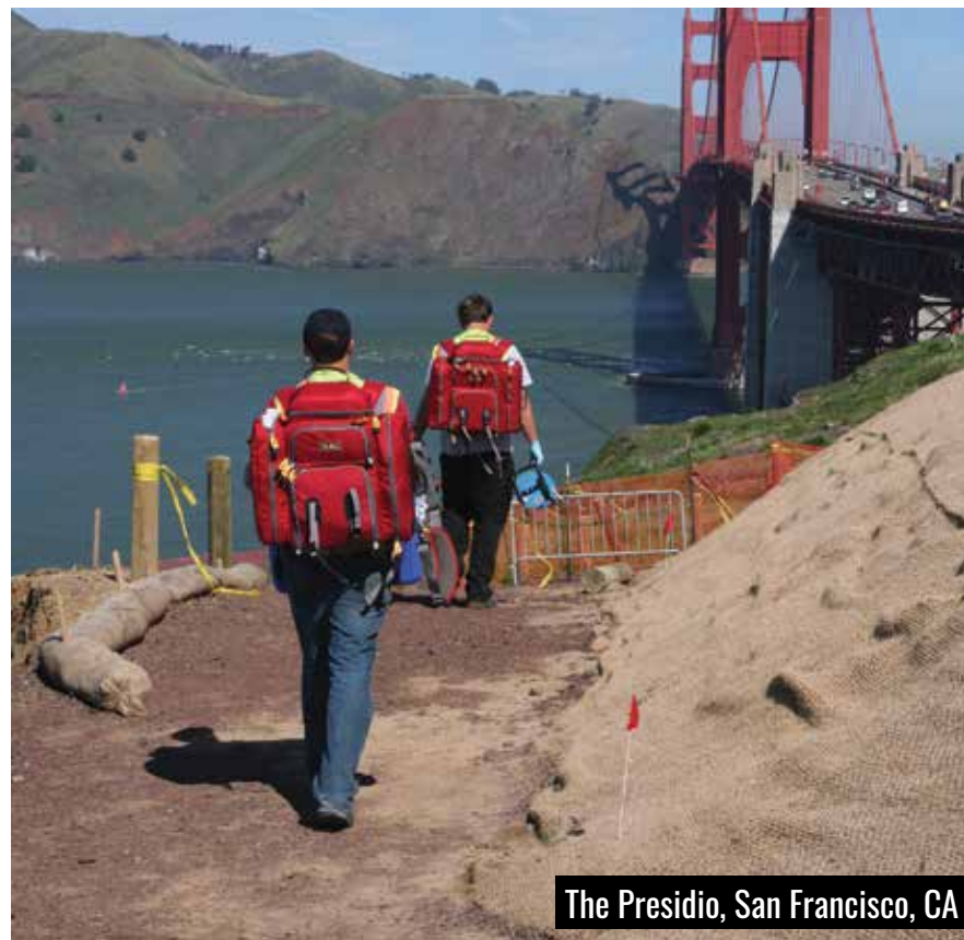
The Presidio, San Francisco, CA