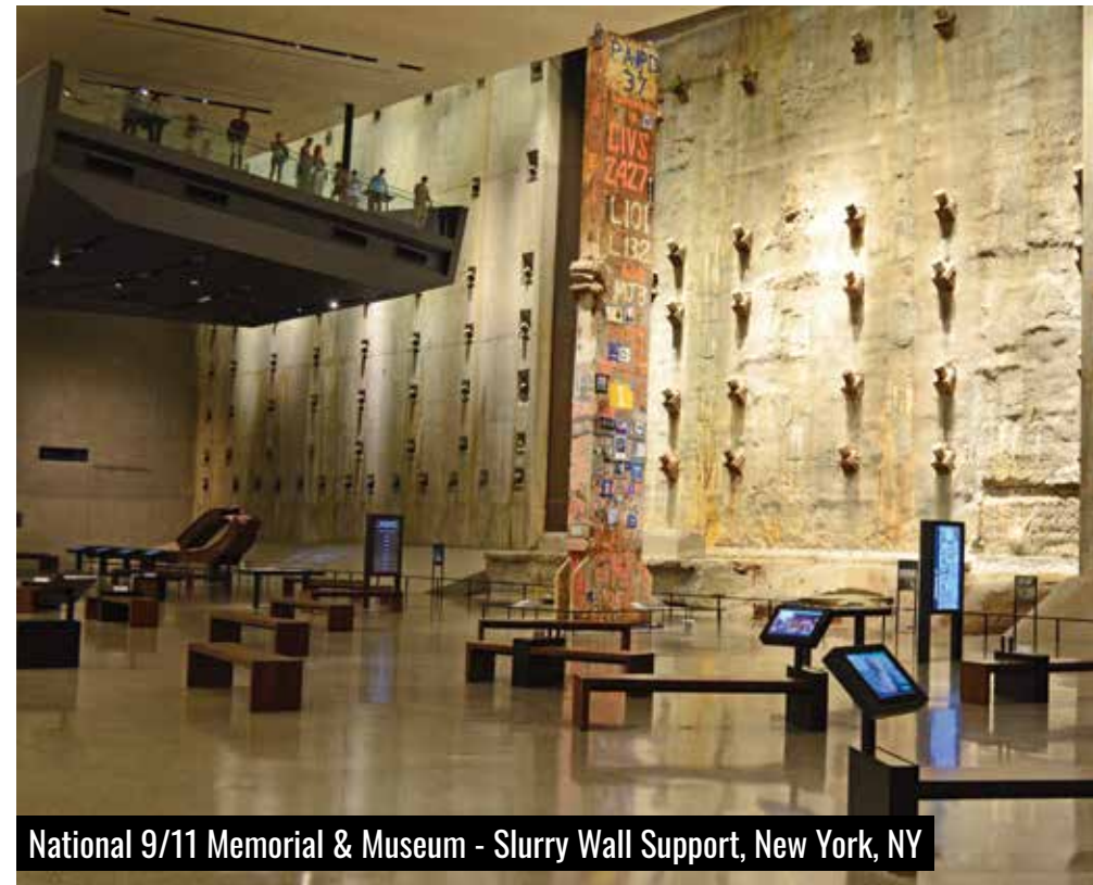
National 9/11 Memorial & Museum - Slurry Wall Support, New York, NY