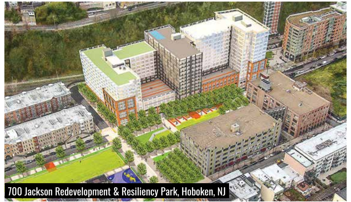
700 Jackson Redevelopment & Resiliency Park, Hoboken, NJ