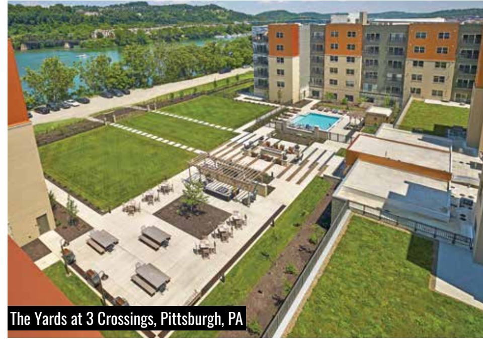
The Yards at 3 Crossings, Pittsburgh, PA