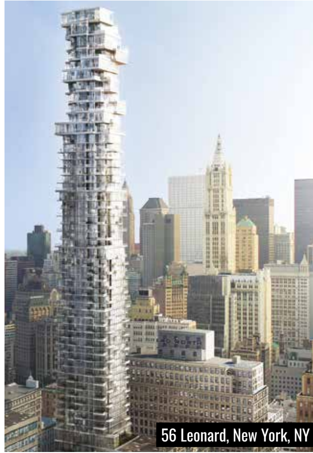
56 Leonard, New York, NY