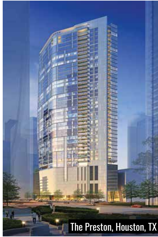
The Preston, Houston, TX