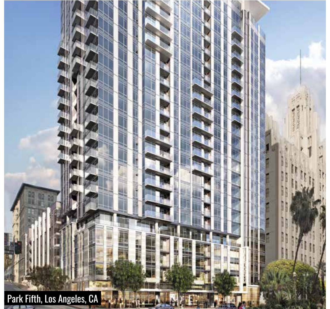
Park Fifth, Los Angeles, CA