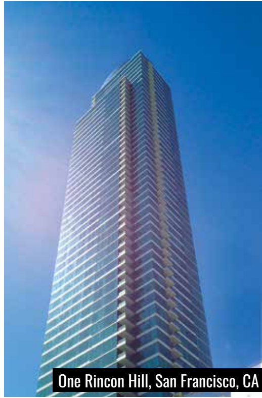
One Rincon Hill, San Francisco, CA