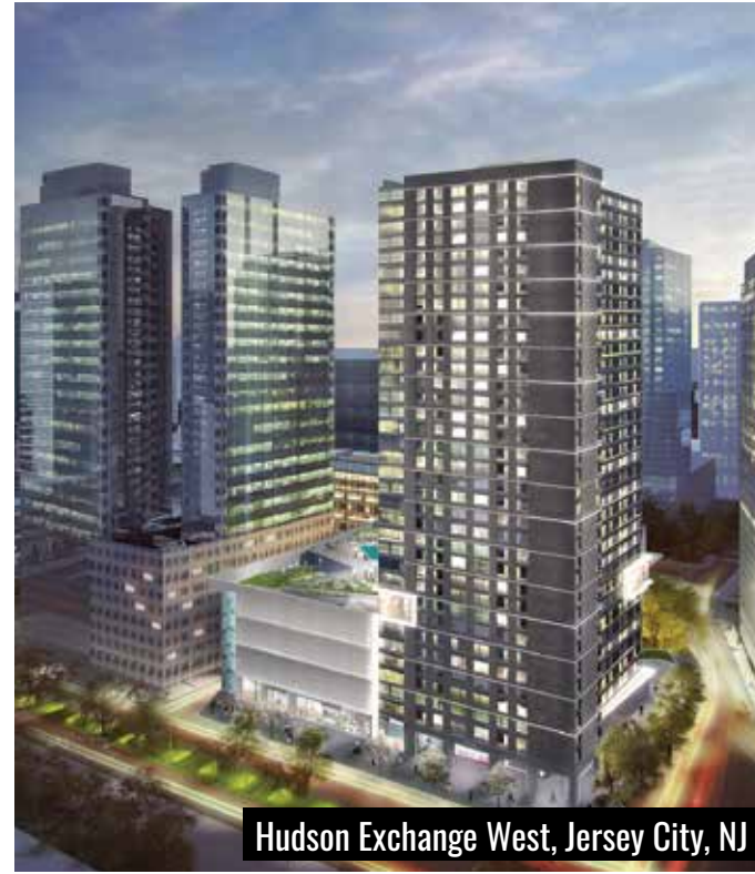
Hudson Exchange West, Jersey City, NJ