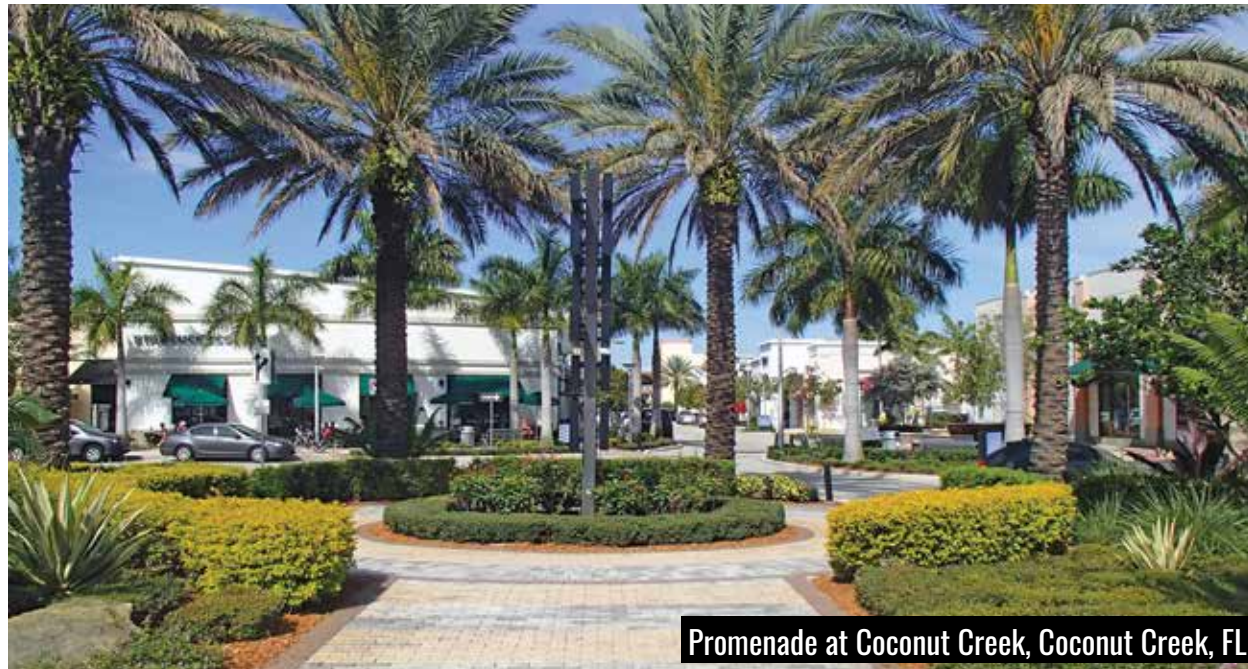
Promenade at Coconut Creek, Coconut Creek, FL