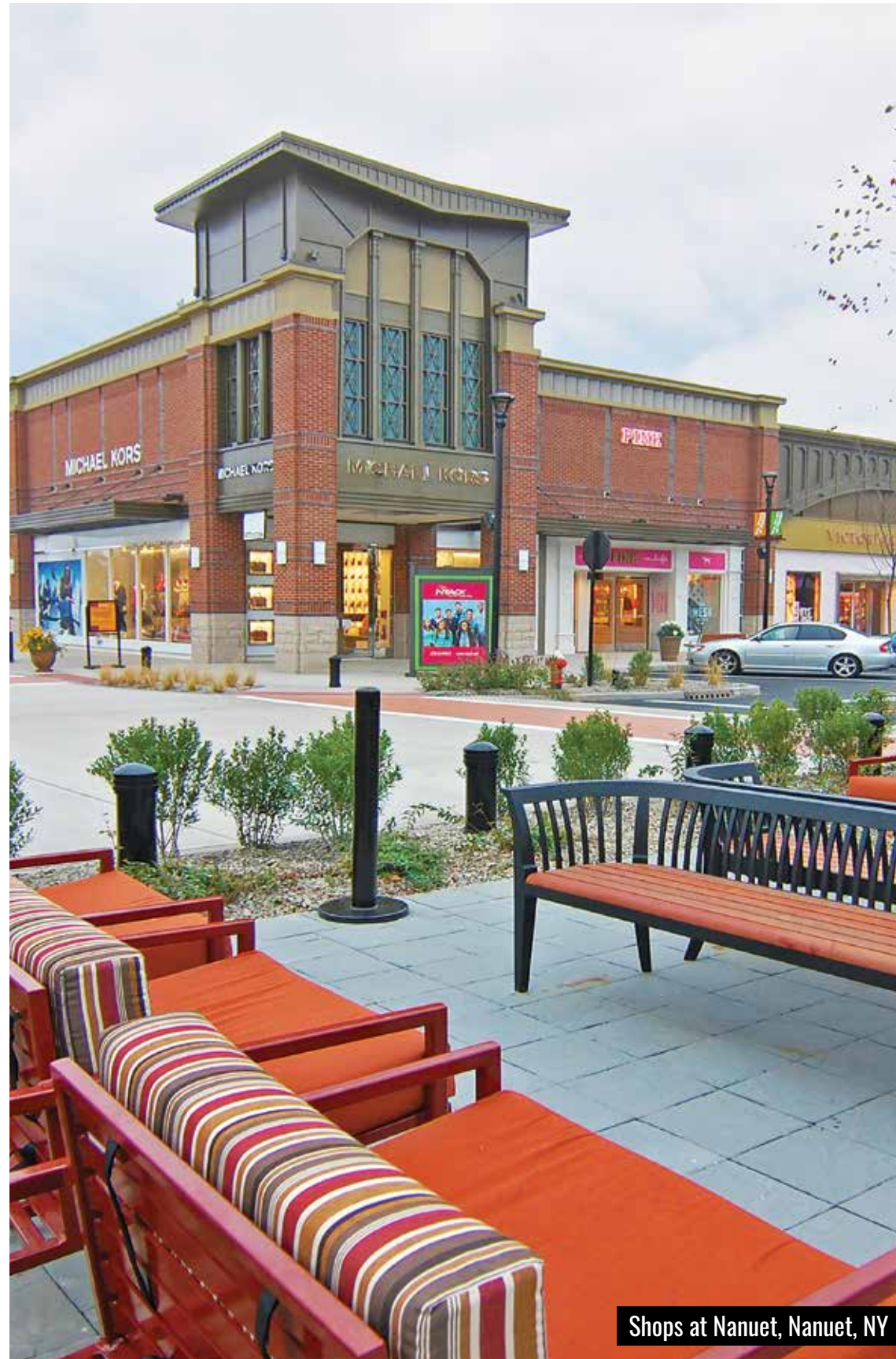
Shops at Nanuet, Nanuet, NY