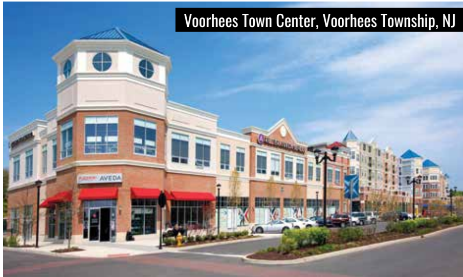
Voorhees Town Center, Voorhees Township, NJ