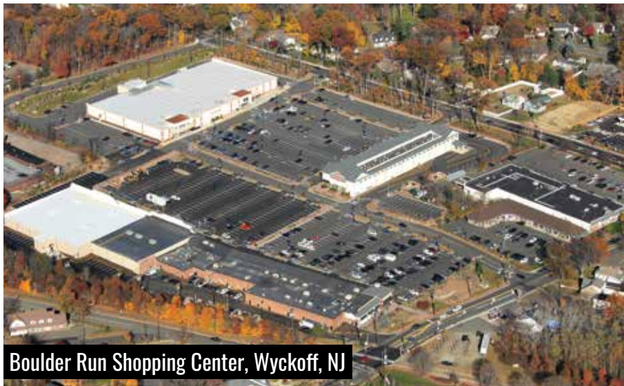
Boulder Run Shopping Center, Wyckoff, NJ