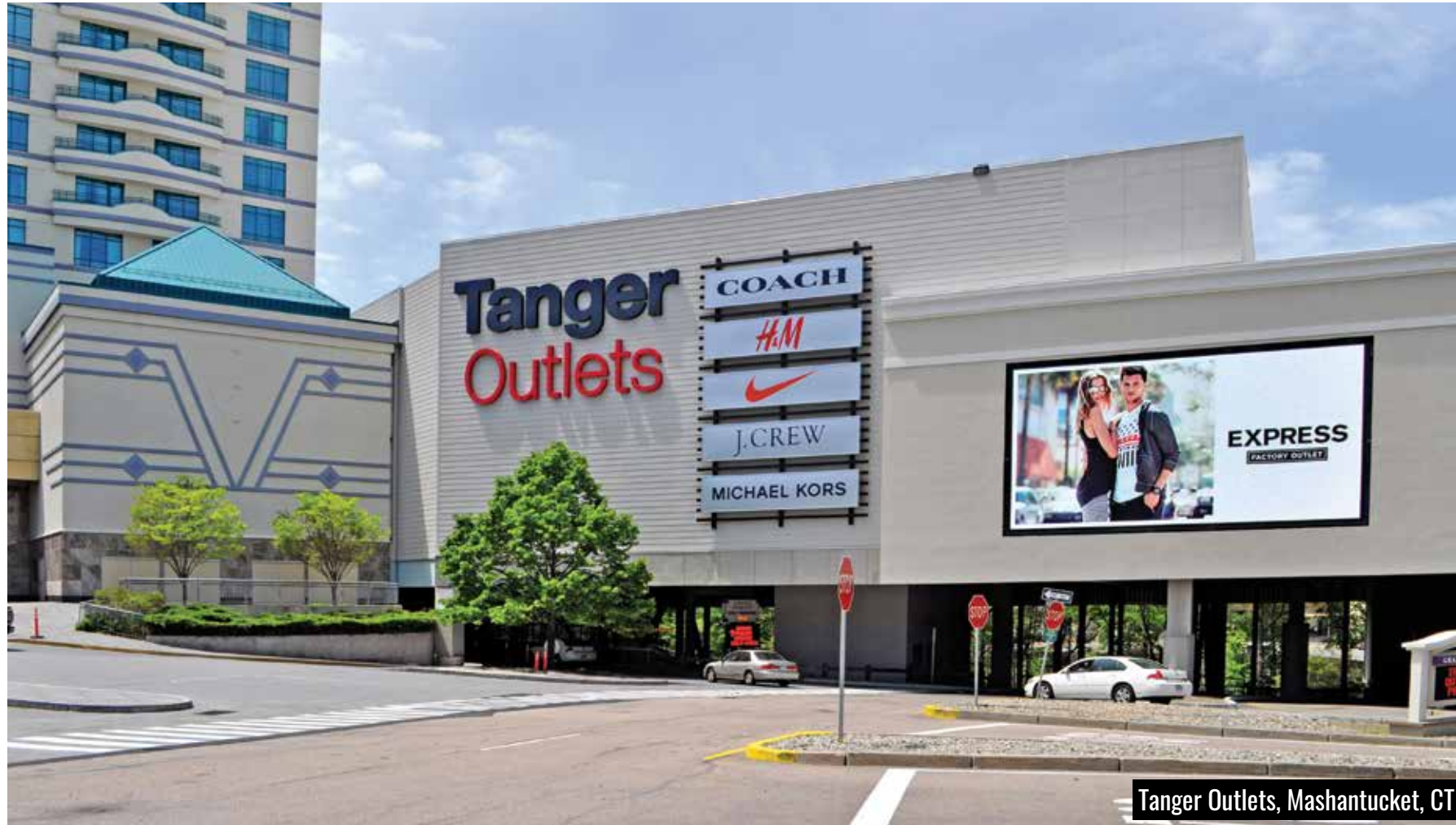
Tanger Outlets, Mashantucket, CT