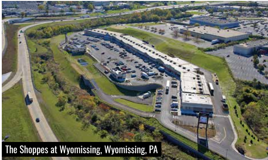
The Shoppes at Wyomissing, Wyomissing, PA