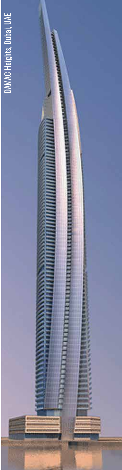
DAMAC Heights, Dubai, UAE