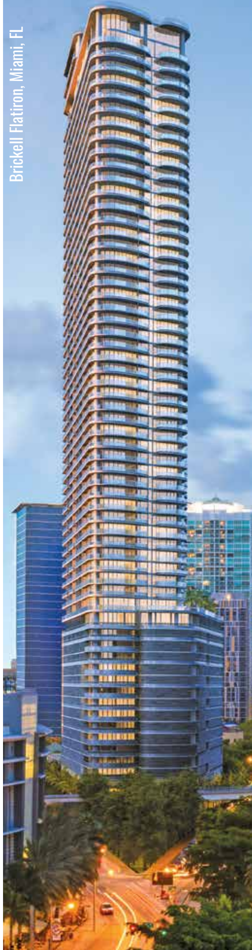
Brickell Flatiron, Miami, FL