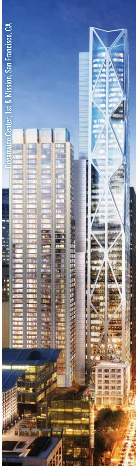
Oceanwide Center, 1st & Mission, San Francisco, CA