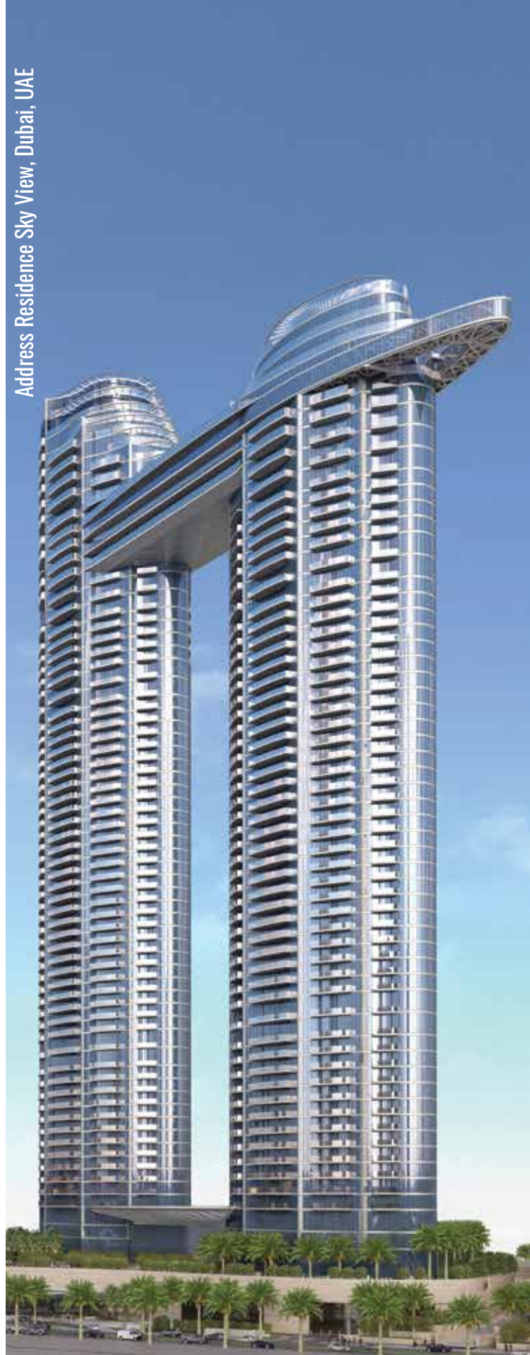
Address Residence Sky View, Dubai, UAE