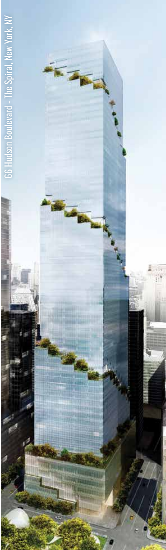
66 Hudson Boulevard - The Spiral, New York, NY