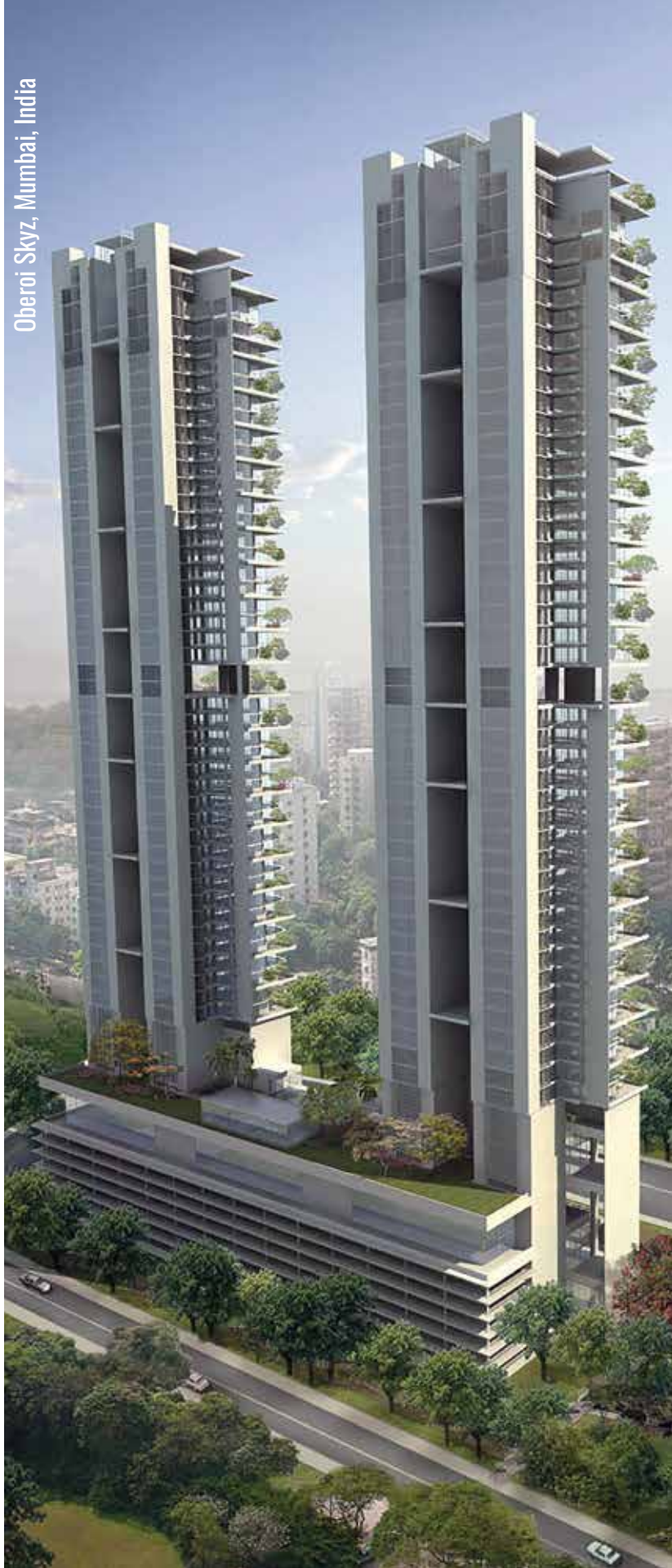
Oberoi Skyz, Mumbai, India