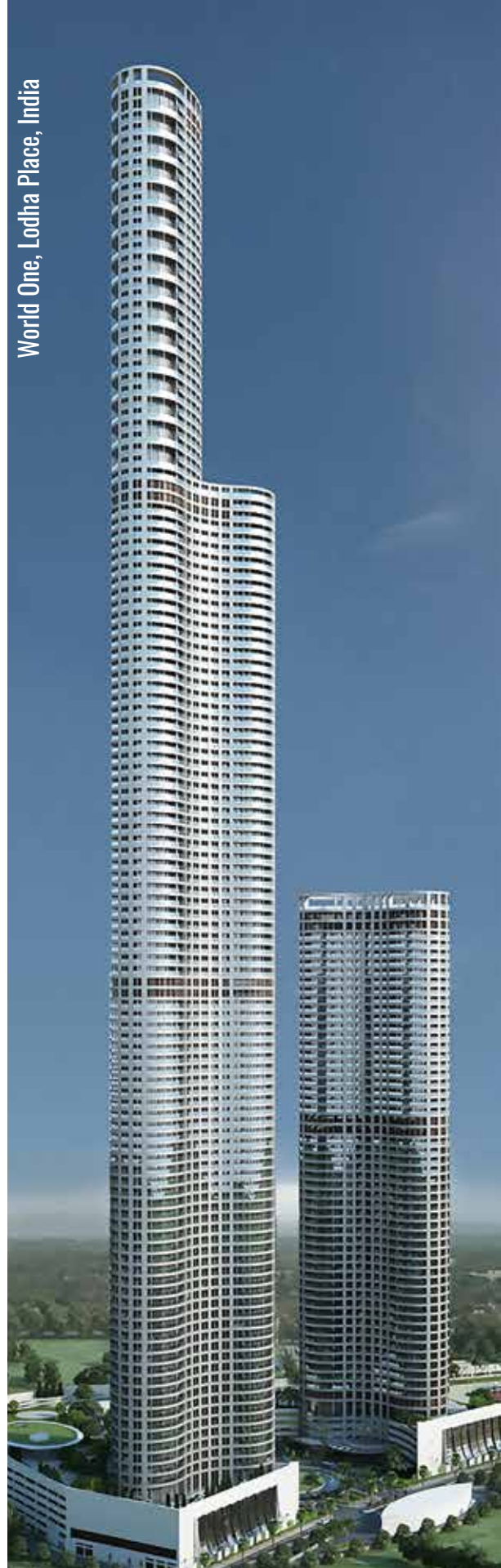
World One, Lodha Place, India