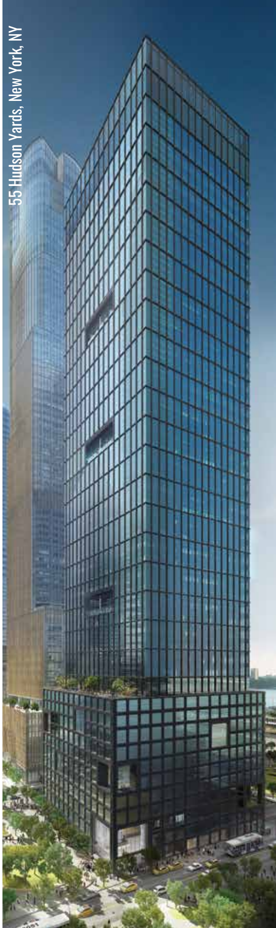
55 Hudson Yards, New York, NY