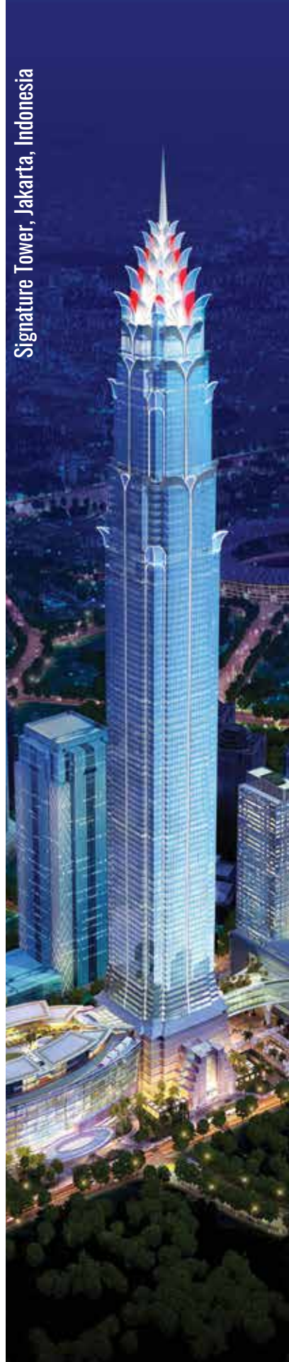
Signature Tower, Jakarta, Indonesia