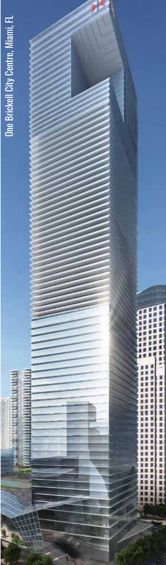
One Brickell City Centre, Miami, FL