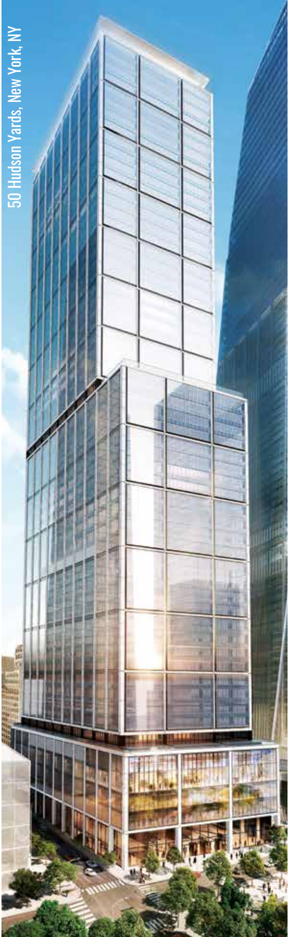
50 Hudson Yards, New York, NY