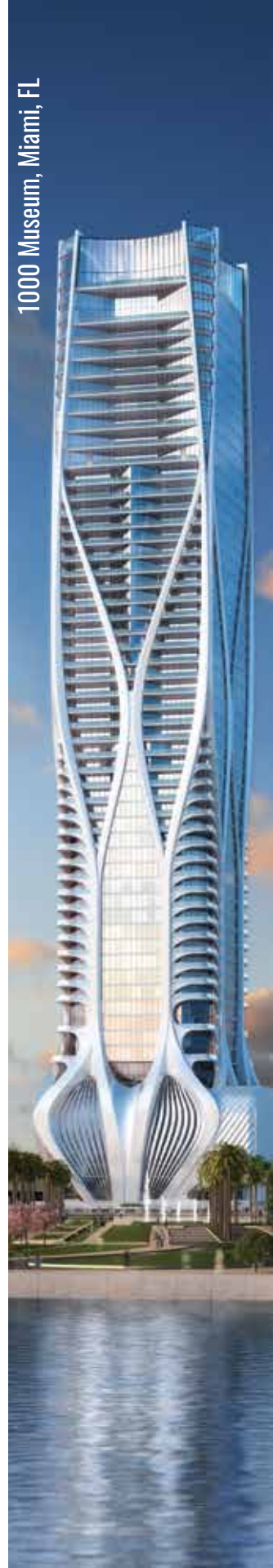
1000 Museum, Miami, FL