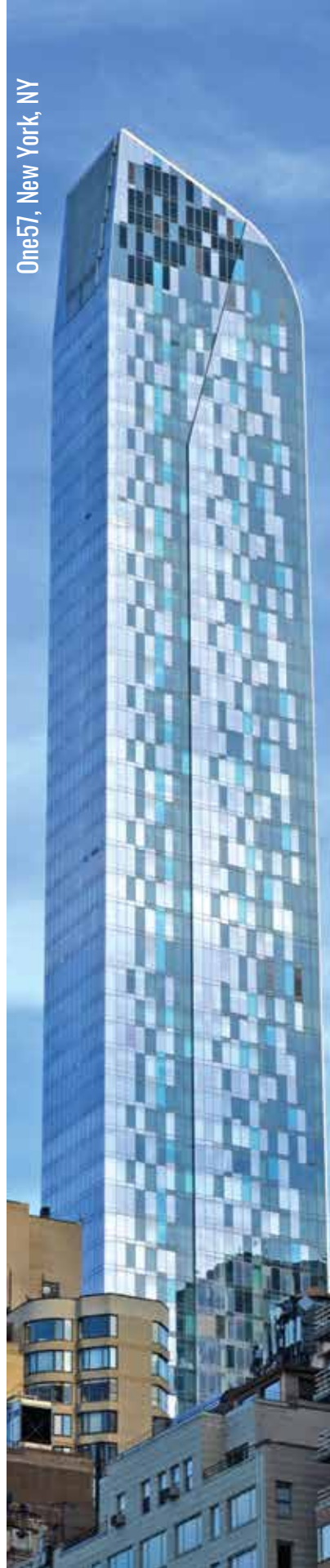
One57, New York, NY