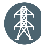
Substations & Transmission Lines