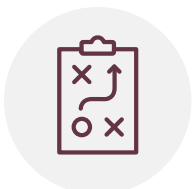
Plan and Prepare

Langan's Digital EHS Management and Compliance team helps our clients from project inception through rollout, and also can provide ongoing maintenance and support.